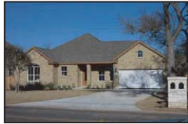
5218 McCarty Ln. SOLD for 99% of listing price!

Your home HAS increased in value! Please call Jaymes for a free Market Analysis!