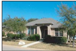
9321 Colberg Dr. FOR SALE! List Price 244,900 As seen on The Open House Show.