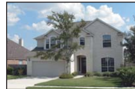
10509 Hansa Dr. FOR SALE! List Price 319,900 As seen on The Open House Show.

"We aren't just your neighborhood specialists, we're YOUR neighbors!"