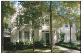
10019 Austral Cv. FOR SALE! List Price 369,900 As seen on The Open House Show.