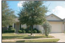
8657 Barrow Glen Loop SOLD in 8 Days! As seen on The Open House Show!