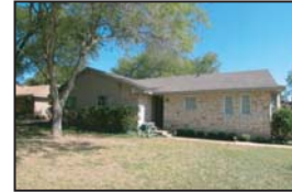
5306 Beckett SOLD in 15 days!